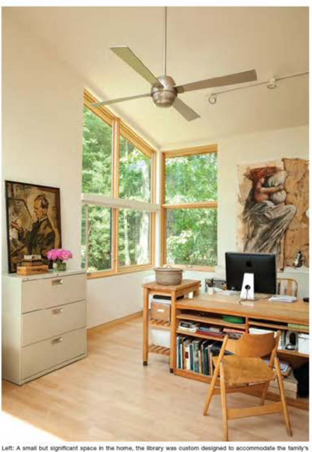
collections. Storage shelves were measured to perfectly fit each series of items. Records, cassette tapes, books and more all have a home within the library. Right: The office is on the second floor of the home, set away from the hustle and bustle of day-to-day activity. The continuation of many windows allows for inspirational workflow with no feeling of containment. Personal artwork adds warmth and energy to the space.

Architect: Peterman Architects Concord, Mass. (978) 341-0900 PetermanArchitects.com